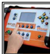
Control panel with GPS