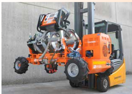
Delta 355 All Terrain lifting

DELTA 355 TRAILER welds HDPE, PP pipes and fittings for the transportation of gas, water and other fluids under pressure from 125 mm to 355 mm (from 4" IPS to 14" IPS). DELTA 355 TRAILER does not have an on board generator and needs external power supply; no traction.