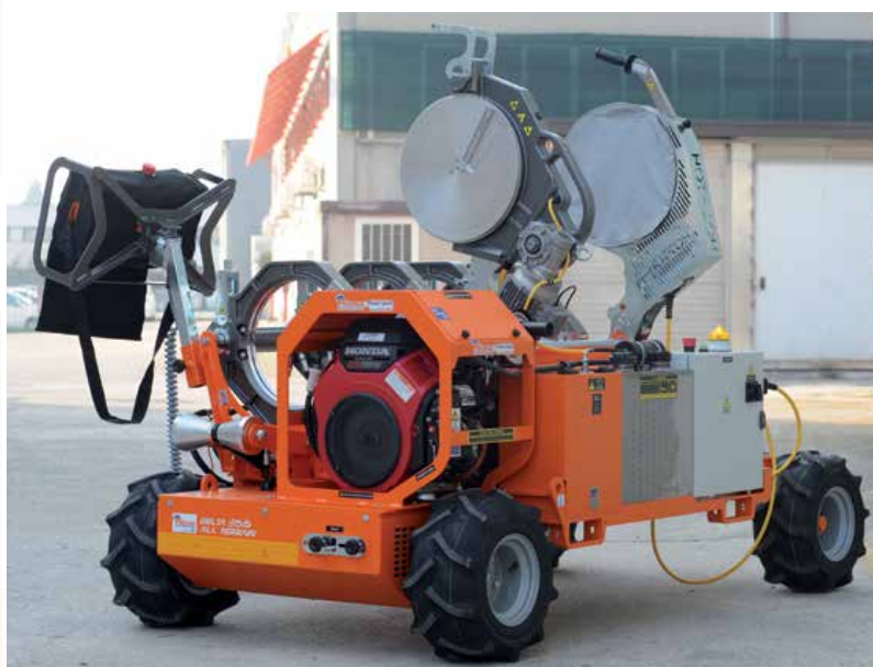
Gasoline or Diesel generator available