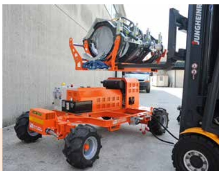
Only machine body lifting