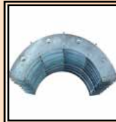
Inserts Ø 200 ÷ 500 mm