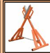
HS Rollers 630