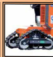
Track Conversion System