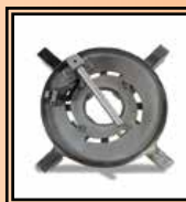
Tool for flange necks