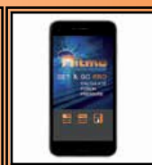
App "Set & Go Pro"