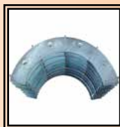
Inserts Ø 200 ÷ 500 mm