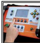
Control panel with GPS