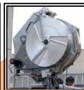
Hydraulic Milling cutter