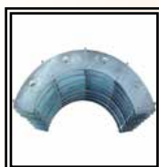
Inserts Ø355÷900 mm