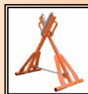
HS roller 630