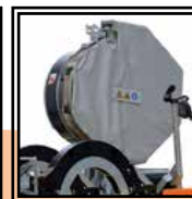
Hydraulic Heating plate