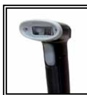
Bar code reader