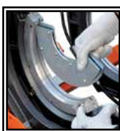
Inserts smartlock \varnothing 75 \div 225 mm \varnothing 90 \div 280 mm