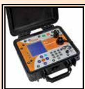
The INSPECTOR Data-logging