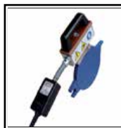
Heating plate with Digital Dragon