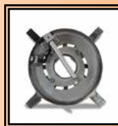
Tool for flange necks

and: Inserts Ø 2" ÷ 6" IPS; 3" ÷ 6" DIPS pre-insulated bag for heating plate