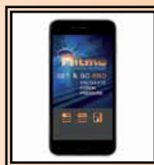
App "Set & Go Pro"