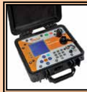
The INSPECTOR Data-logging