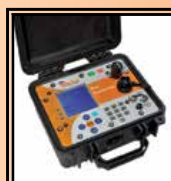
The INSPECTOR Data-logging