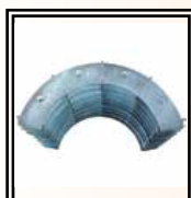
Ø 800 ÷ 1400 mm Master Ø 1200 mm Tool for flange necks