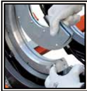
Inserts Ø 75 ÷ 225 mm