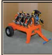
Trolley for machine body