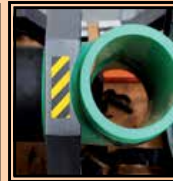
Top Clamp Short Elbows/Tee