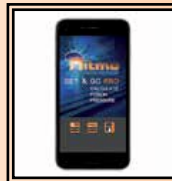
App "Set & Go Pro"