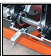
Detach device for heater