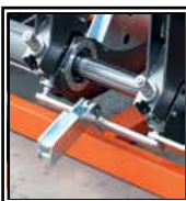
Detach device for heater