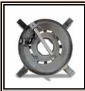
Tool for flange necks