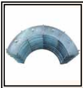
Inserts Ø 800 ÷ 1400 mm