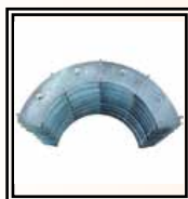
Inserts Ø 280 ÷ 560 mm