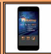
App "Set & Go Pro"