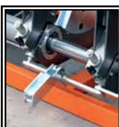
Detach device for heater